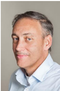
Prof. Robert Steinfeld

This implies a key role for neurons and not glia in CLN3 brain network dysfunction, and also that clearance of the typical storage type seen in CLN3 may neither be an appropriate readout indicative of therapeutic effects nor a reliable biomarker.